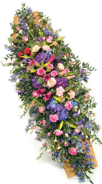
Pink & Mauve