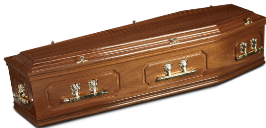
The Sandringham £1600 A solid medium stain mahogany coffin featuring casket handles a raised lid and panelled sides