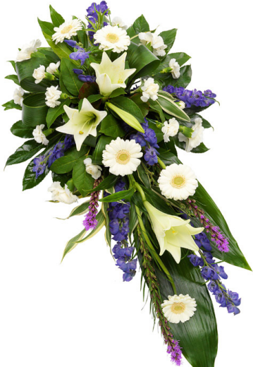
Purple & White