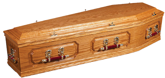
The Churchill £2200 A truly premium solid oak coffin presented in a honey-oak finish (handles as shown for burial only)