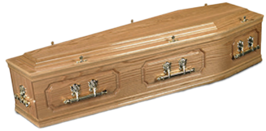
The Buckingham £1600 A Solid oak coffin featuring casket handles a raised lid and panelled side