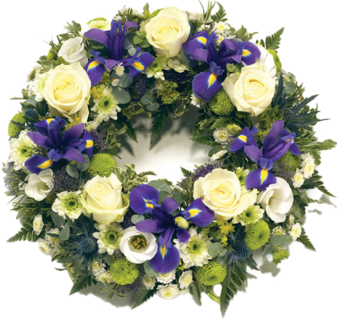
Purple & White