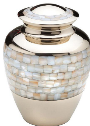
Brass & Pearl