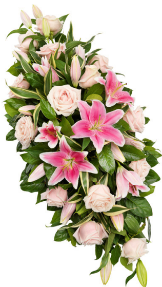
Rose & Lily

The traditional floral tribute for a coffin top. These sprays are clearly visible, while not being overly commanding. These tend to measure approximately four foot in length. Prices range from £180 to £300 with the rose and lily pieces commanding the higher price point of this bracket.