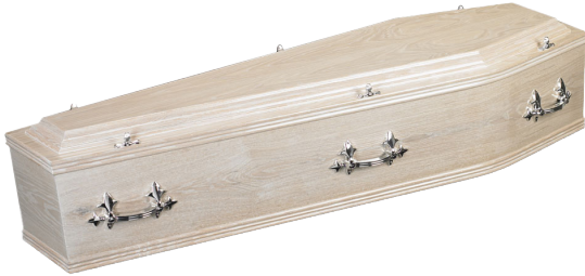
The Windermere £800 A classic and simple limed oak veneer coffin with double raised lid