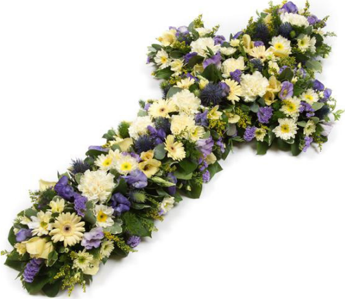
Purple Cross (4ft) Loose Effect