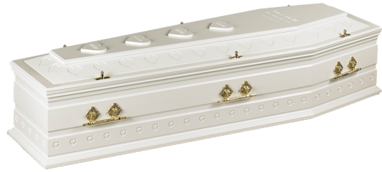
Valentino (White) £1750 A unique high quality coffin supplied with up to 6 wooden keepsake hearts, individually engraved with a name or title