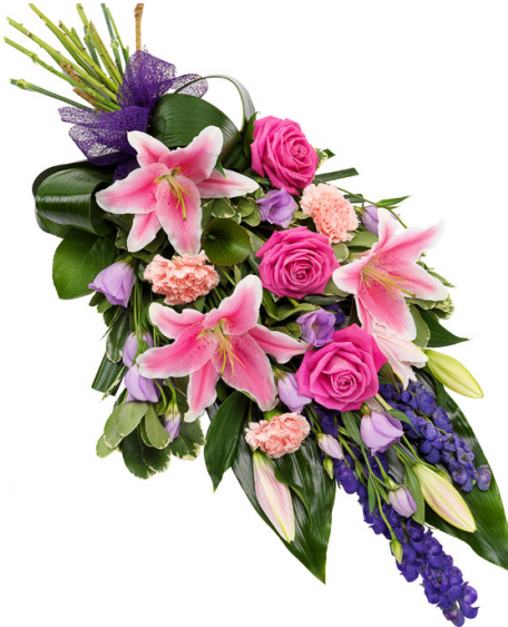
Pink & Purple