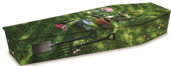
In the Garden