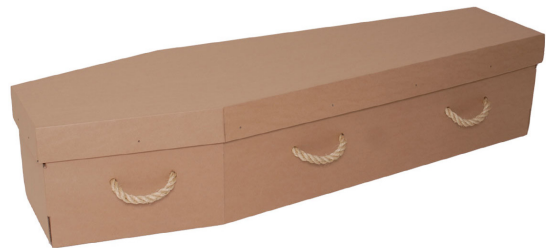
Cardboard (Brown) £650 A high quality cardboard coffin manufactured from corrugated cardboard. A sturdy and dignified alternative to traditional wooden styles.