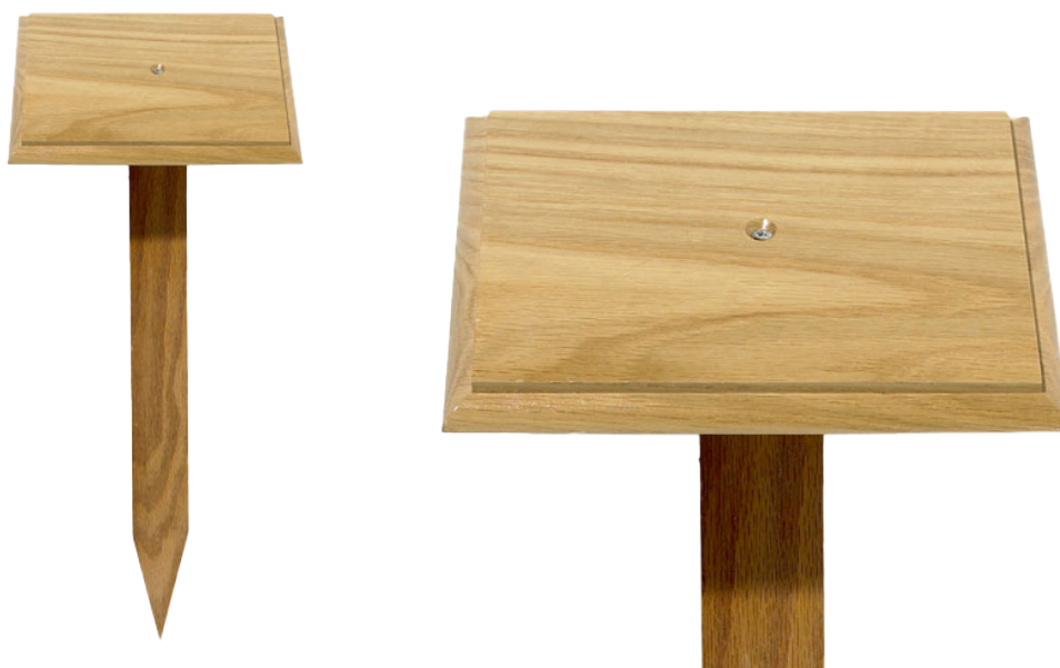
Temporary oak marker with engraved plate

A solid wood memorial with a custom engraved plaque, designed as a temporary marker prior to installation of the memorial headstone.