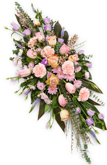
Pink & Mauve