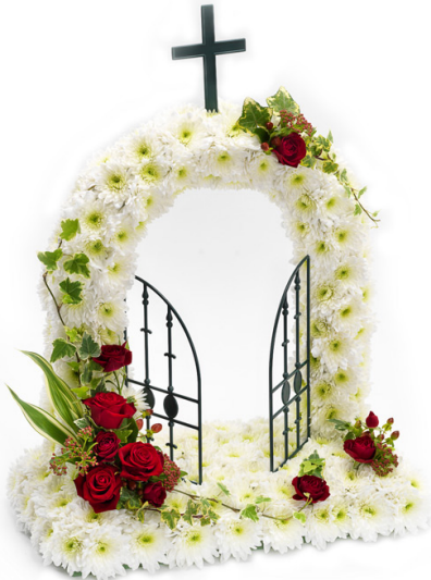
Gates of Heaven