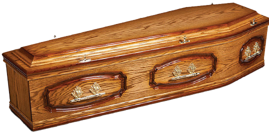
The Brunel £2000 A two-tone premium oak coffin finished in piano gloss with a raised lid and oyster panelling