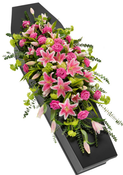
Rose & Lily