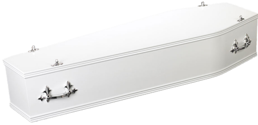
The Modern £900 A contemporary traditionally shaped coffin available in various pastel colours.