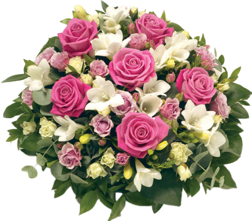
Pink & White