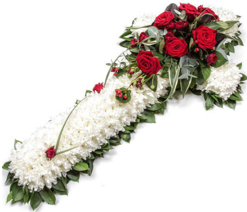
White Cross (4ft) Blocked Effect