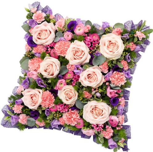
Pink & Mauve