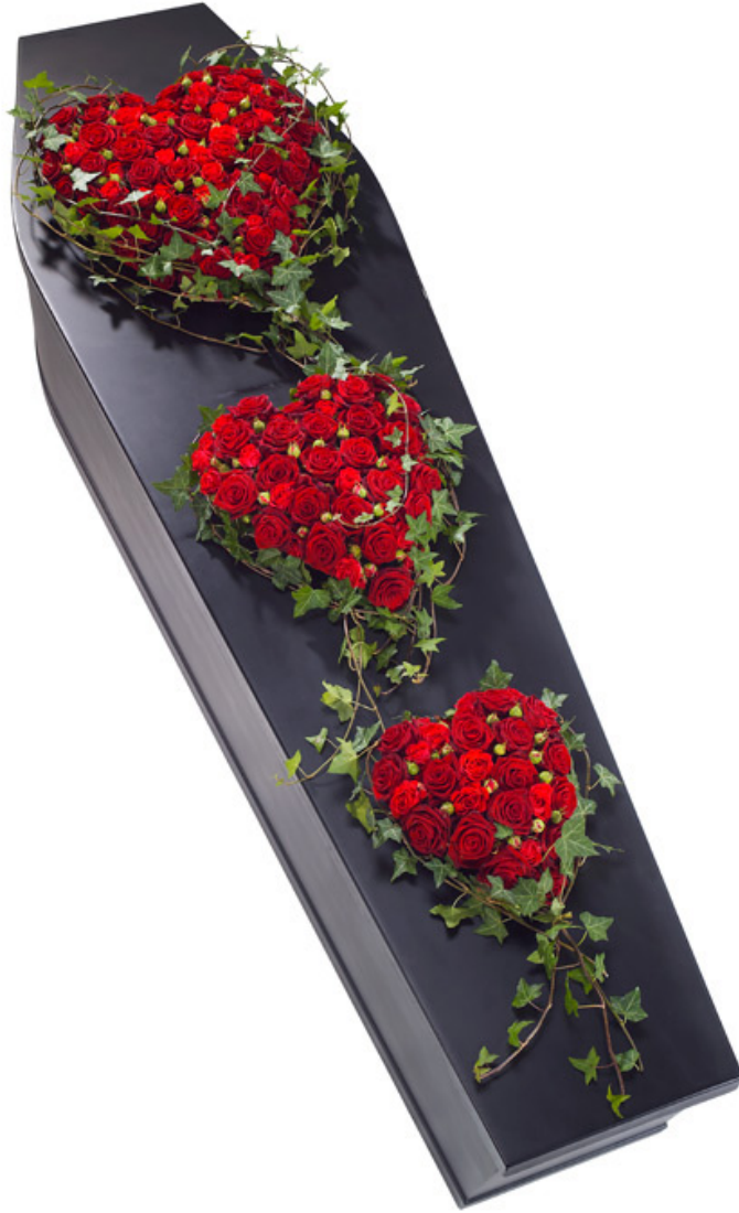
Red Rose Trio