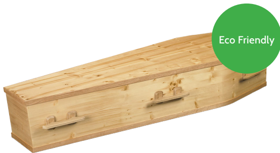
The Forester £1000 An eco-friendly pine coffin with wooden handles, made from all natural wood – a perfect choice for the eco-conscious individual