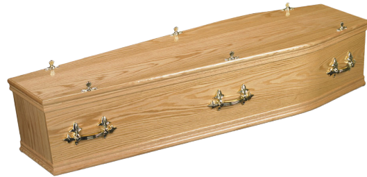
The Kensington £1250 A simple yet highly traditional solid oak coffin