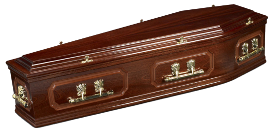
The Richmond £700 A dark stained, mahogany-veneered coffin. Featuring routed-panel sides and a raised lid