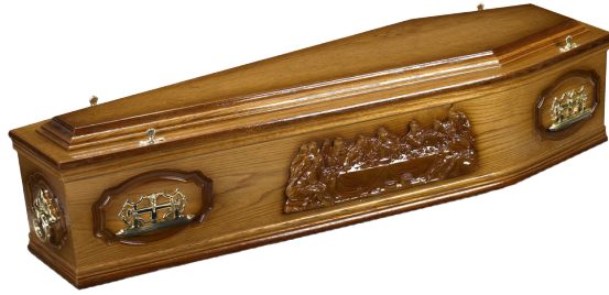
The Last Supper £1400 A premium two-tone oak coffin depicting The Last Supper